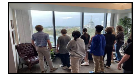
Students view the Capitol Building, Historic Old Capitol, and City Hall from the Leon County Courthouse

During the week of March 22, Mustangs enjoyed the Civics field trip to the courthouse, The Riley House, and Smokey Hollow. While at the courthouse, students viewed some cases and participated in a mock trial where they learned about being jurors and other roles of members of the court. In the Riley house, they got the chance to look at life in the 1800s through the eyes of the Riley family. In Smokey Hollow, students got to see the beautiful herbs and plants as well as how houses were built in Smokey Hollow. They even saw an old-fashioned barber shop!